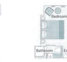
Emerald Riverview Suite